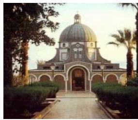
Mt of Beatitudes